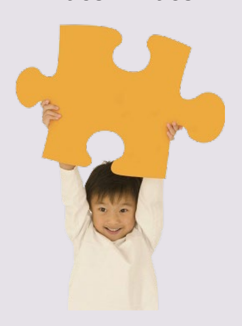
Bachelor Degree in Early Childhood Elementary Majors with EC focus Associates Degree in Early Childhood